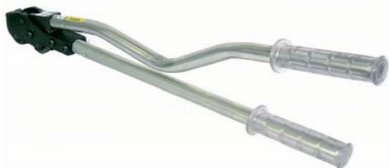
CHART OF TYPES