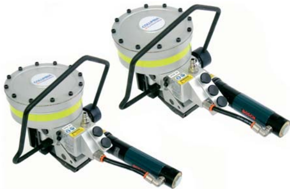
CHART OF TYPES