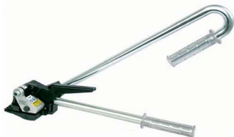
CHART OF TYPES