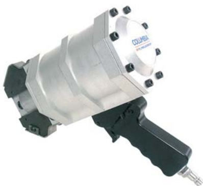
CHART OF TYPES