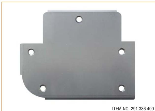
ITEM NO. 291.336.400