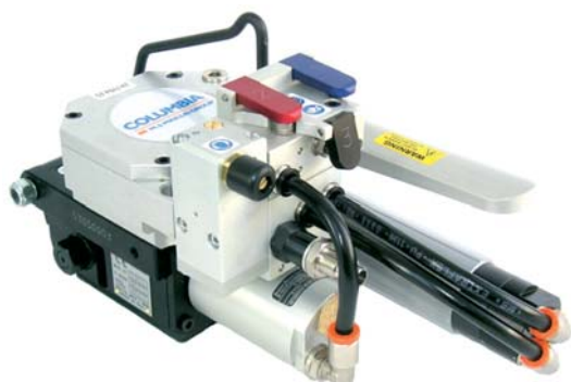
CHART OF TYPES