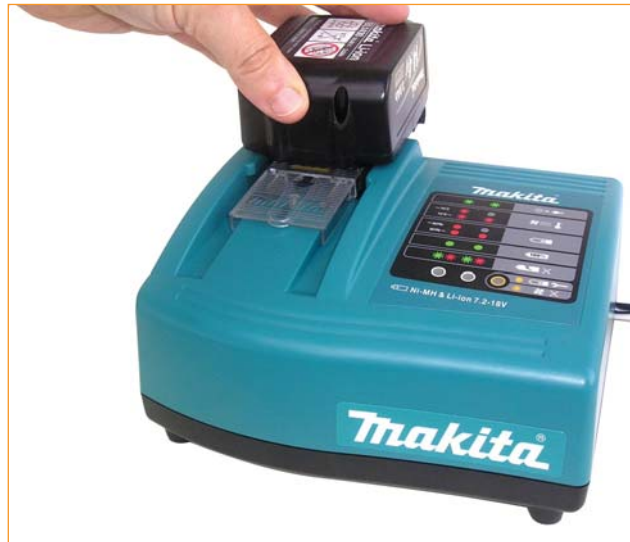
Recharger for Li-ion Battery