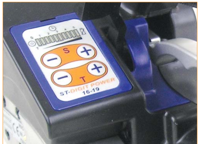
New digital adjustment system for tension and sealing time