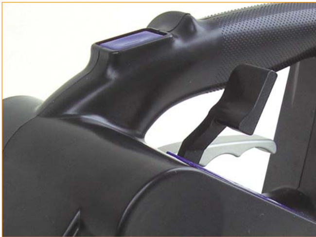
Ergonomic handle - New sealing and opening lever