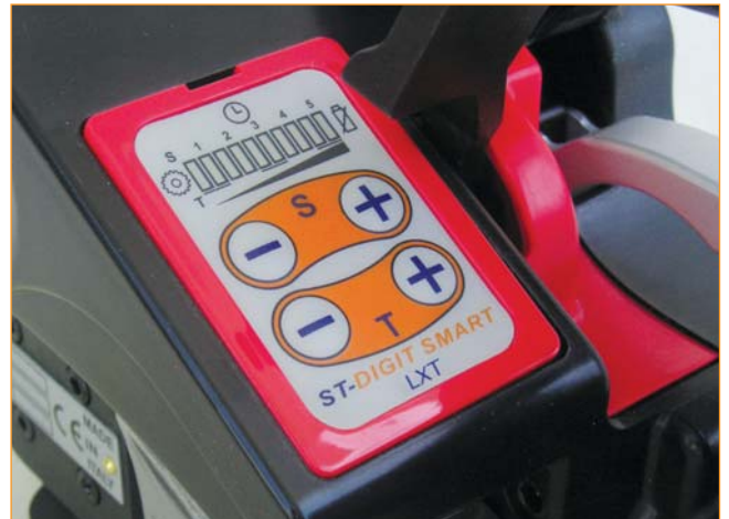
New digital adjustment system for tension and sealing time