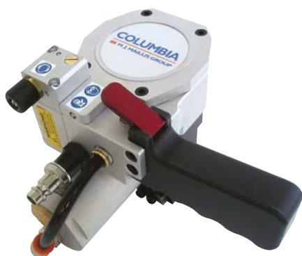
CHART OF TYPES