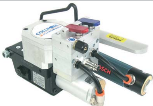
CHART OF TYPES